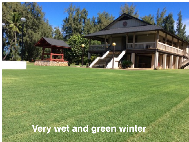
Very wet and green winter

Without inner peace, outer peace is impossible. We all wish for world peace, but world peace will never be achieved unless we first establish peace within our own minds. We can send so-called "peacekeeping forces" into areas of conflict, but peace cannot be imposed from the outside with guns. Only by creating peace within our own mind and helping others to do the same can we hope to achieve peace in this world.